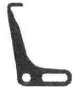
RFL 125 LF

Height: 101mm Width: 78mm Rod: max. 11mm Pitch: 28-50