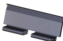
Centre Belt cut out