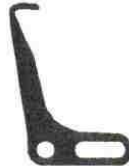
RFL 75 LF

Height: 80mm Width: 83mm Rod: max. 12mm Pitch: 28-50