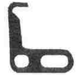
RFL 50 LF

Height: 59mm Width: 72mm Rod: max. 12mm Pitch: 28-50