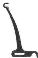
RFL 150 net

Height: 158mm Width: 78mm Rod: max. 12mm Pitch: 28-50