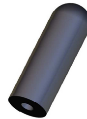
RUBBER Haulm Finger 110 x 24 (Inside 8mm) 72° Shore A