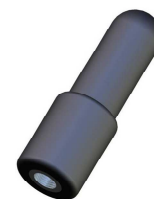
RUBBER Haulm Finger 70 x 23/17,5 (Inside 8mm) 72° Shore A