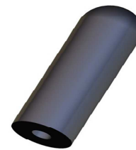
RUBBER Haulm Finger 78 x 25 (Inside 8mm) 72° Shore A